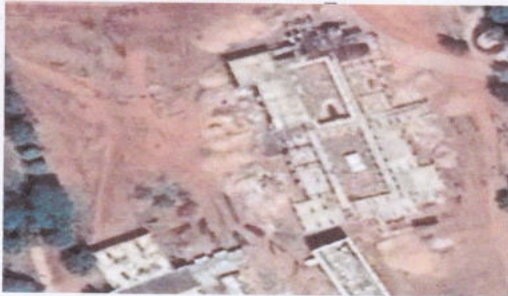
Arial View -Site 1