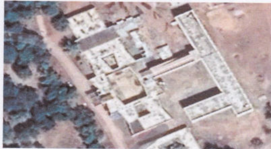
Arial View -Site 2

Prateek Nishad 22-2 PRATEEK NISHAD (Regd. Geologist Municipal Corporation)